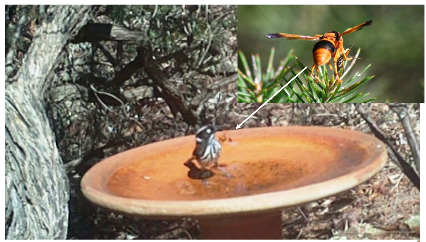
Above: A New Holland Honeyeater draws back from an attacking Potter or Mason Wasp 'Abispa ephippium' (photo inset). The honeyeater's white eye seems to be rather enlarged. Usually quite an aggressive bird it was certainly uncomfortable with the wasp.

These 'Observations' or 'Sightings' are added to the TNC Data Base, currently with a repository of nearly 5,000 observations dating back to 1925. These are not just 'Members' observations but include extracts from the diaries of old Toodyay residents.