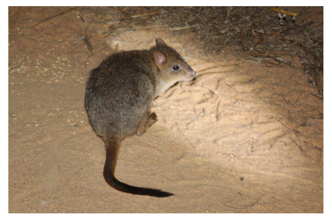
Above: The 'Critically Endangered' Woylie ((Bettongia penicillata) photographed at Wadderin